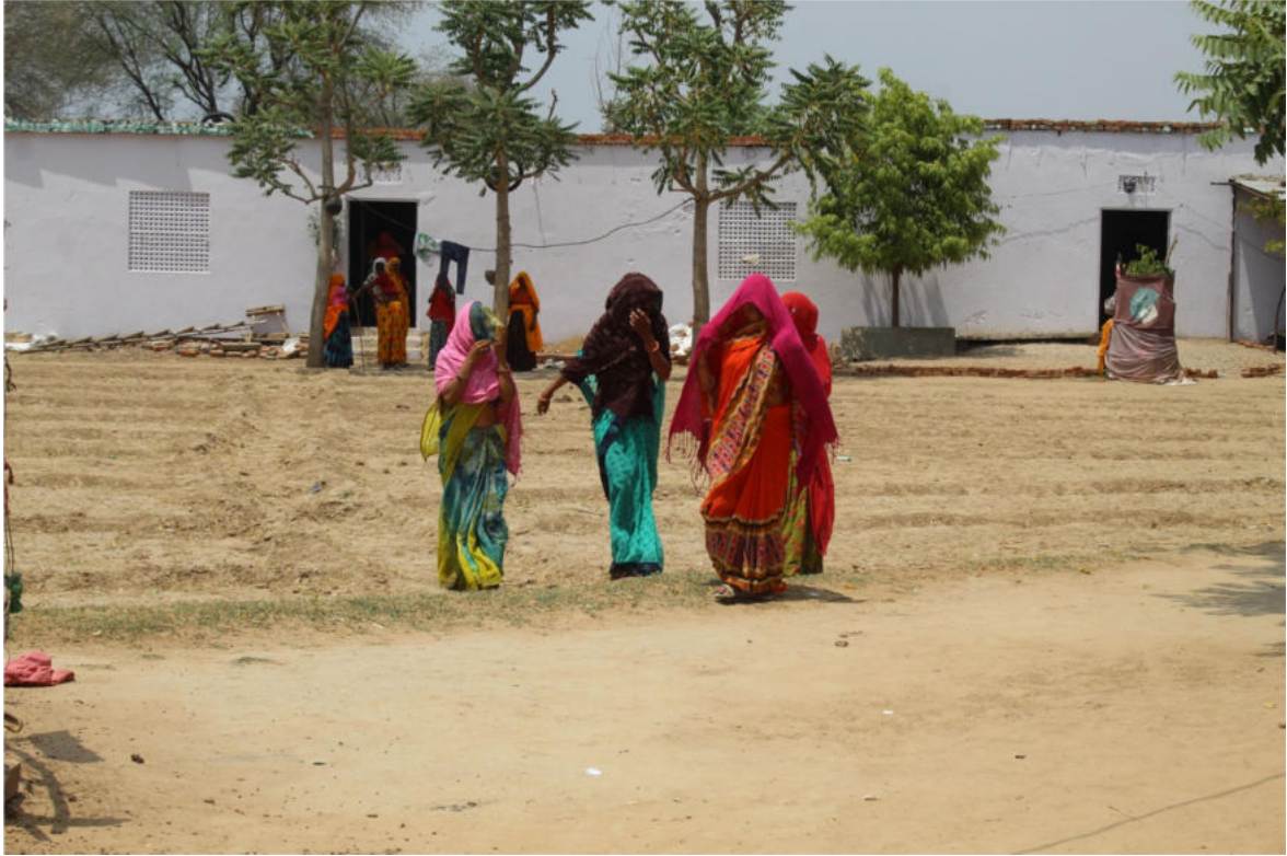
Cotton Mat training work restarted