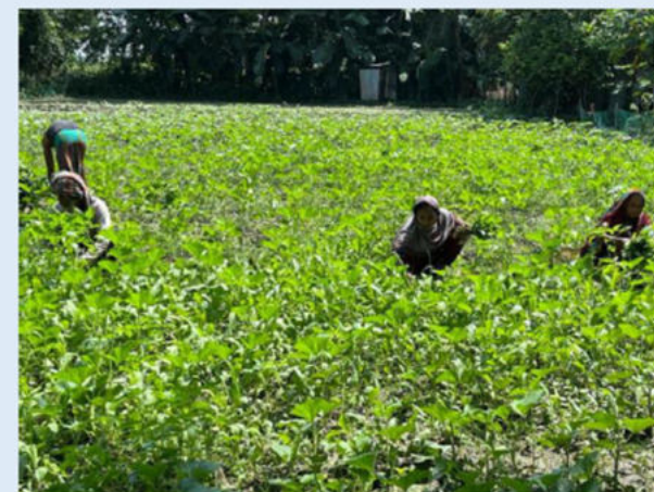
Field Trip at a glance