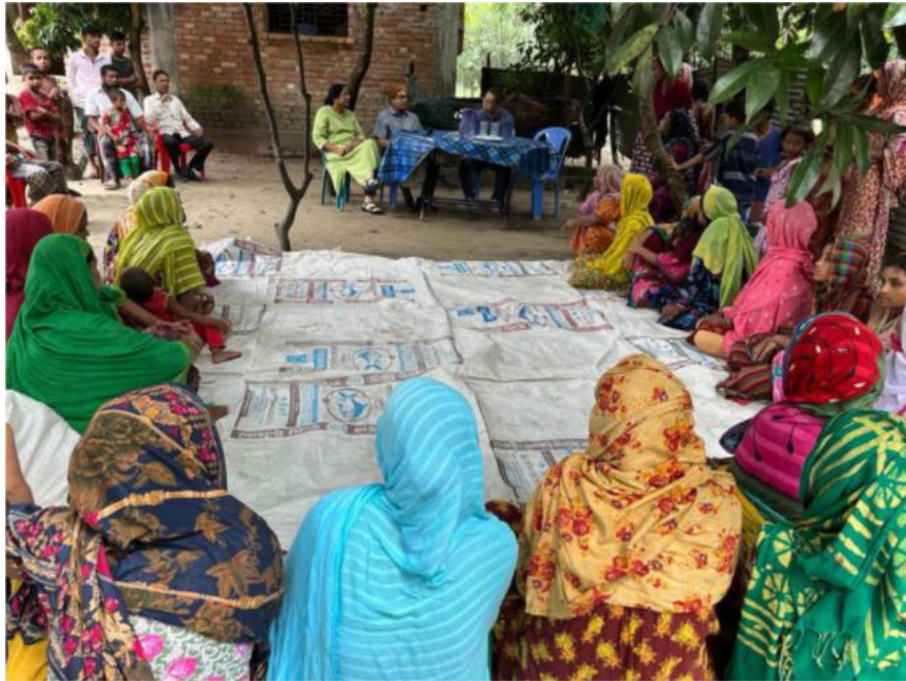
Focus Group Discussion

During the focus group discussion, participants shared their concerns about the effects of land degradation on their communities. Many expressed worry about the loss of soil fertility and the impact on agriculture, which is a major source of income for many families.