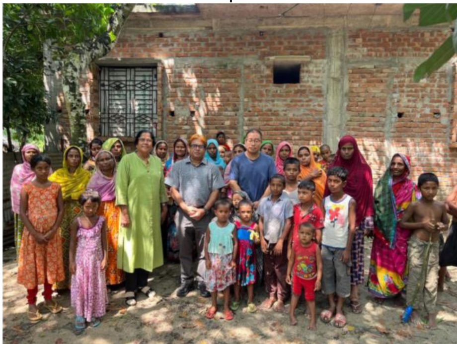
Group Photo after the FGD session