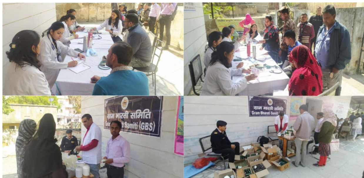
Photos of Camp, Amer