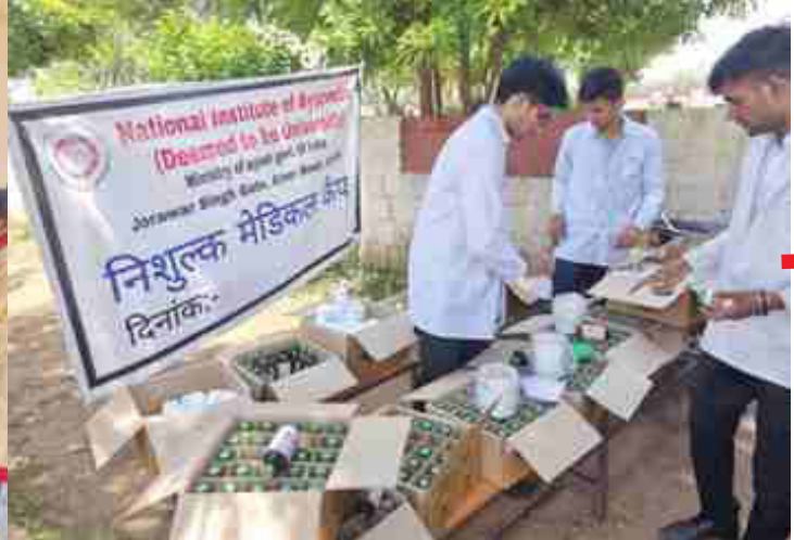
Photos of Arjunpura Camp