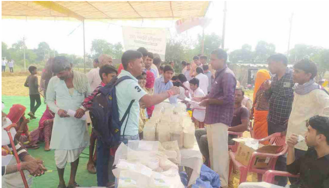
Chemist distribute medicines to the women and girls in village KelaKa Bass