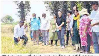
राजसूयारमाला पर वर वंशुसु वरकरीरसुसु वरकरीरसुसु

वर सुसुसु वरकरीरसुसु वरकरीरसुसु राजसूयारमाला पर वर वंशुसु वरकरीरसुसु वरकरीरसुसु