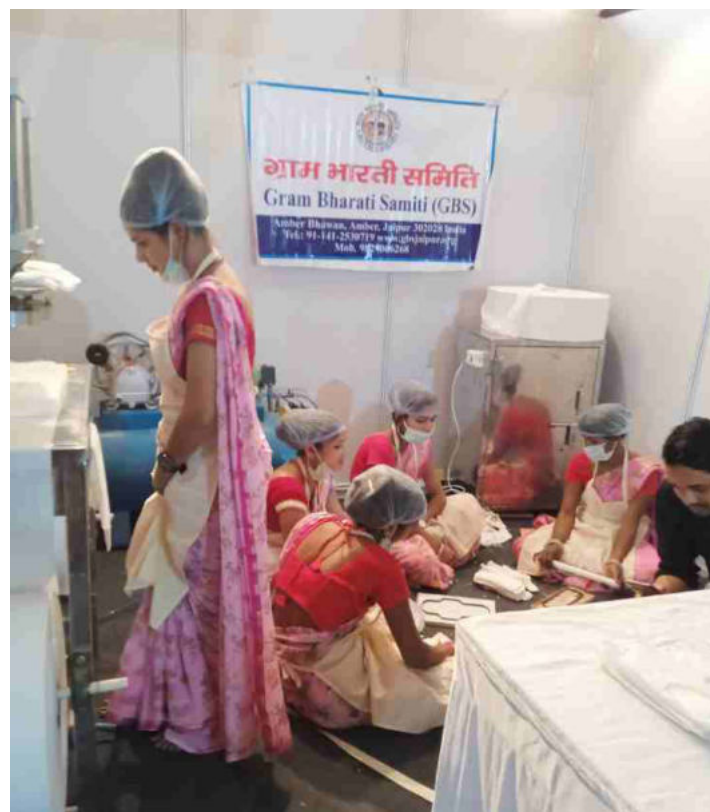
Women of SHG live demonstration of sanitary pad making machine in exhibition