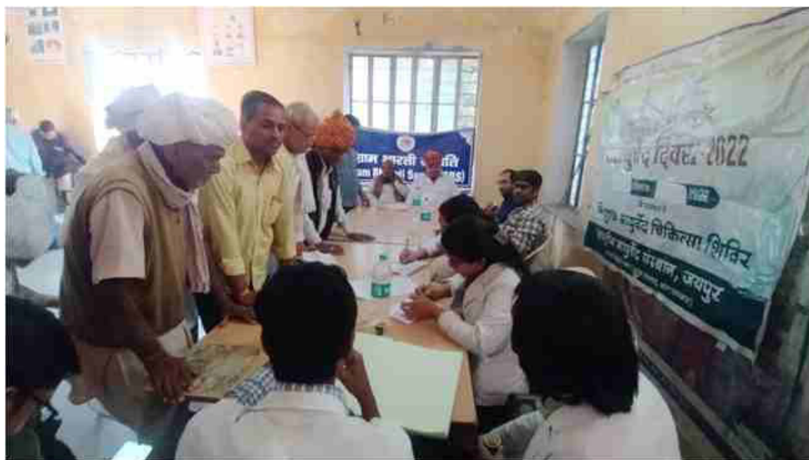
Doctors team diagnosis and written medicine to patient

Most of them are victim of malnutrition and have several kinds of diseases i.e. jaundice, scabies, itchinness, eruptions on the skins, ear and stomach related problems etc.