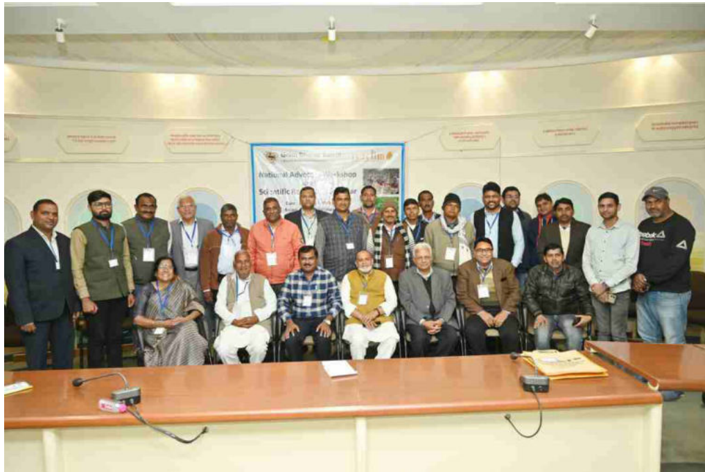
Group photo with the chief guest and other key leaders