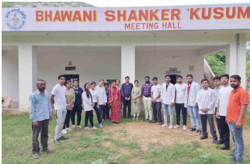
NIA Doctors team at Gandhivan