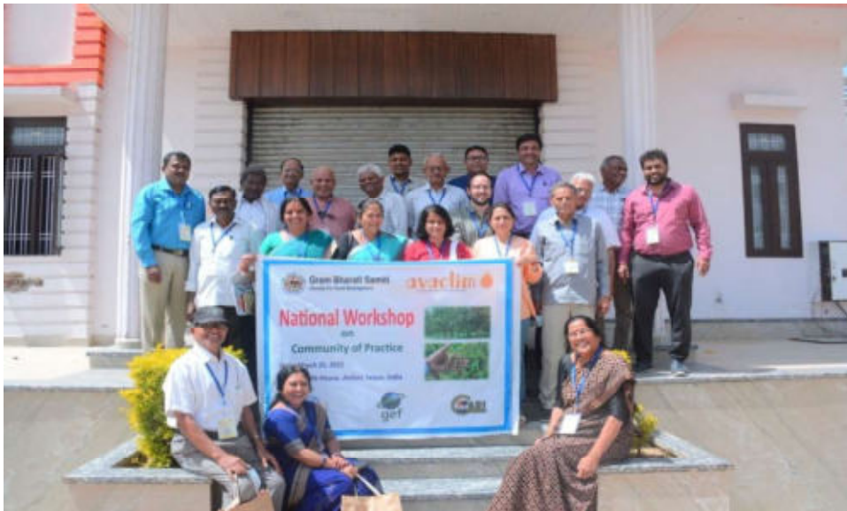
Group photo of National Workshop, March 25-26, 2022 Jaipur Rajasthan India