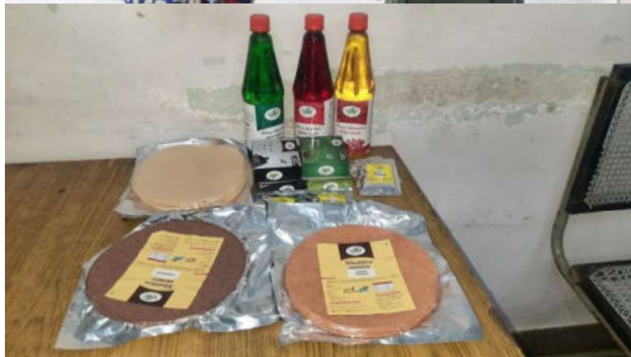
Food kits distribution to adivasi women by Kusum Lata Jain