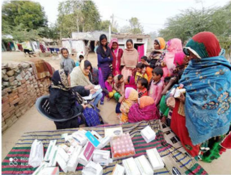
Medical camp organized in village Jugalpura

Mobile health care services continued with generous support from the Runnebaum Foundation, Germany. During the year medical camp regularly organized in the villages of GBS area of operation.