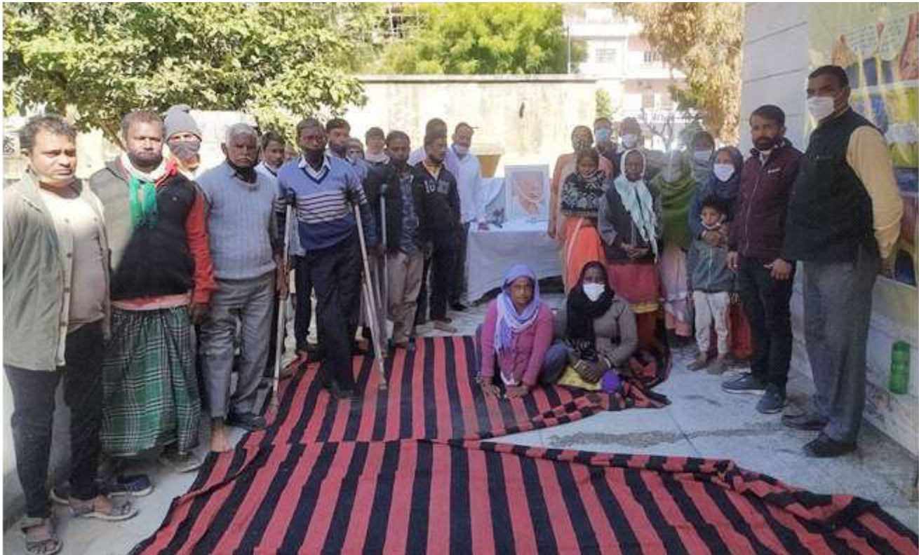
Community prayer for communal harmony at Gandhivan Jaipur Rajasthan India