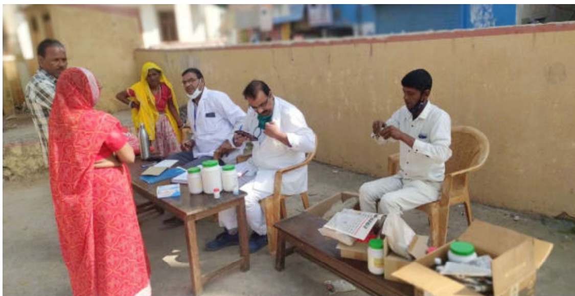
Adivasi beneficiaries in the Ayurvedic Medical Camp