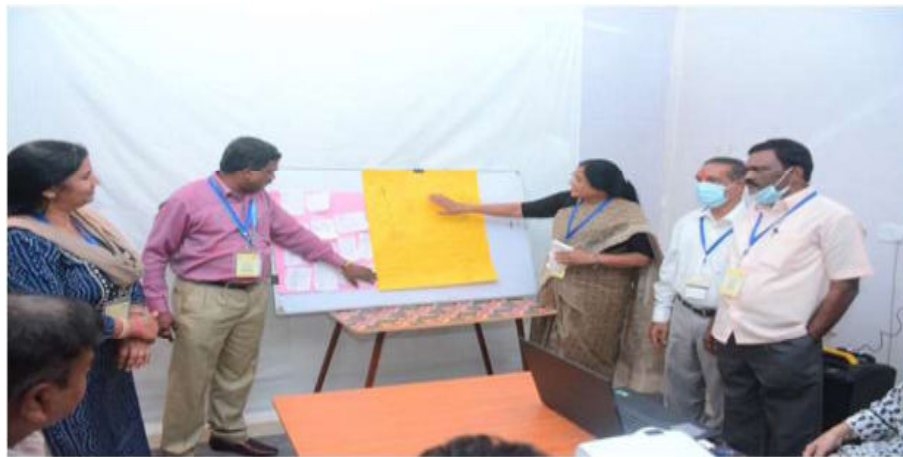
Group presentation on the role of policy makers in the country