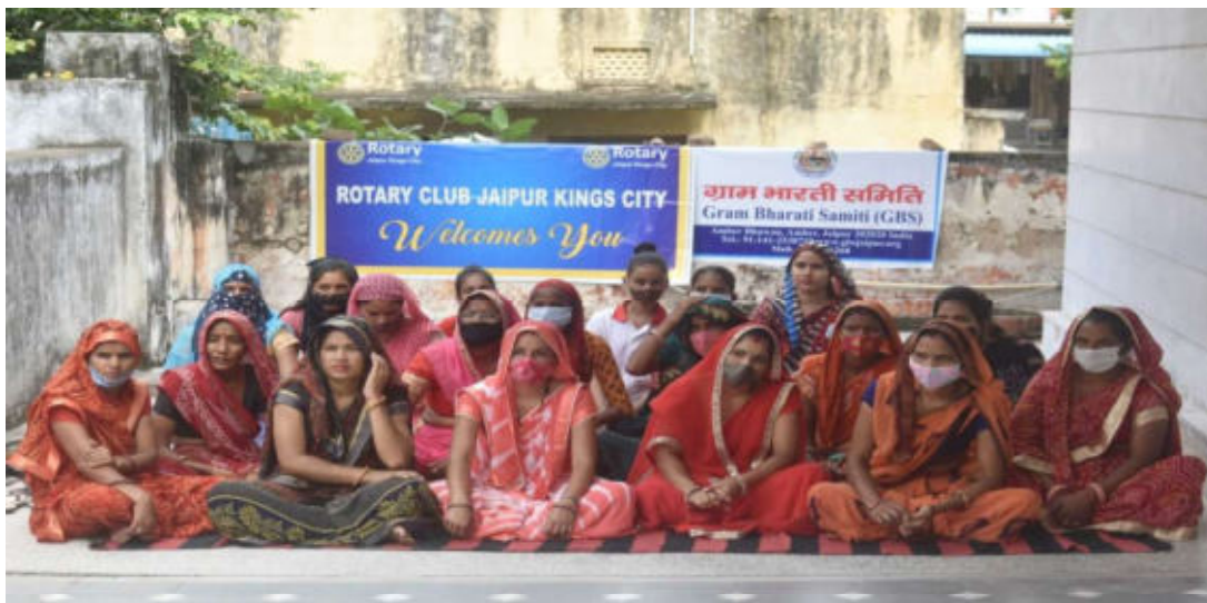
Group photo of Women benefitted with the above captioned event