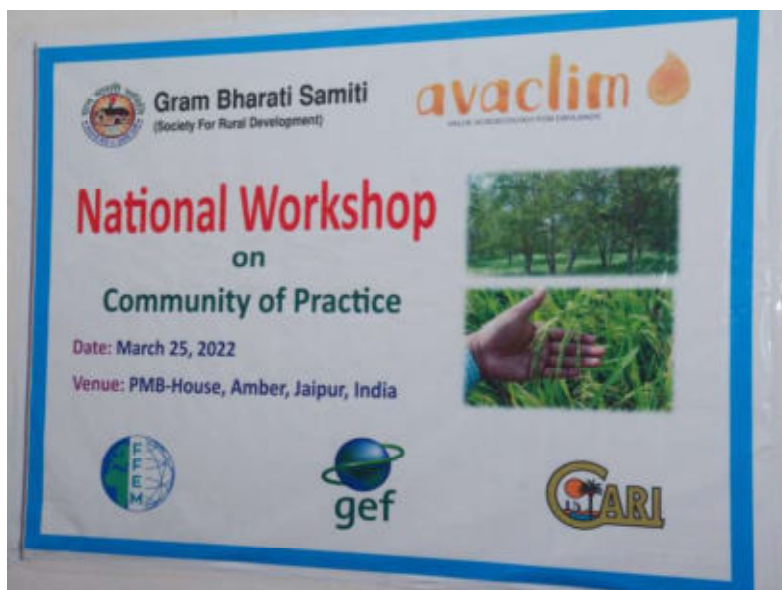
Banner of the National Workshop conducted on 25,26 March 2022 at Jaipur Rajasthan India

In the month of March 2022 two offline workshops were conducted at Jaipur on Community of practice and advocacy as per the guidelines of the avaclim project.