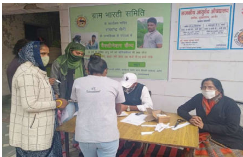
Administration of covishield vaccination at GBS Office, Amer Jaipur