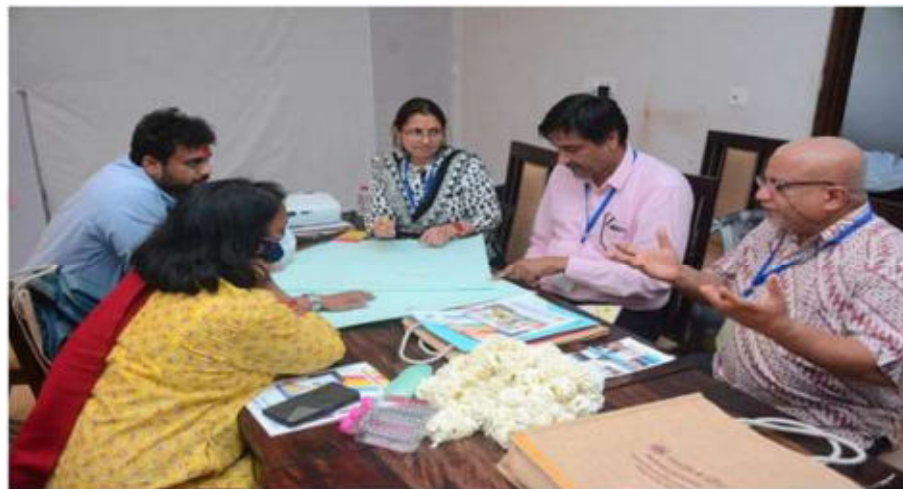
Group discussion on role of CSOs in agro ecology project in the country