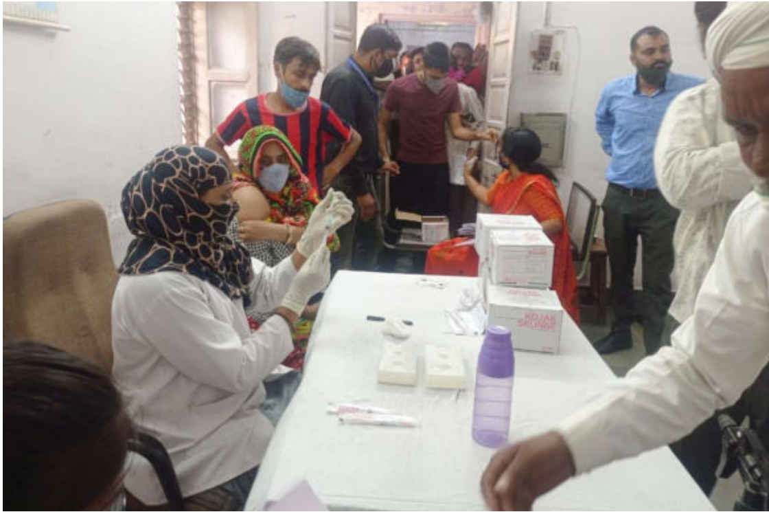
Villagers being administered with covishield vaccination at GBS Office, Amer