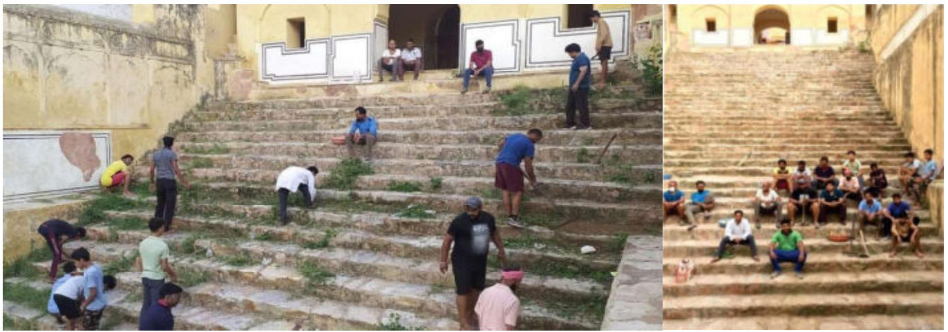
Glimpses of Gram Bharati Samiti Major Achievements in the last three years