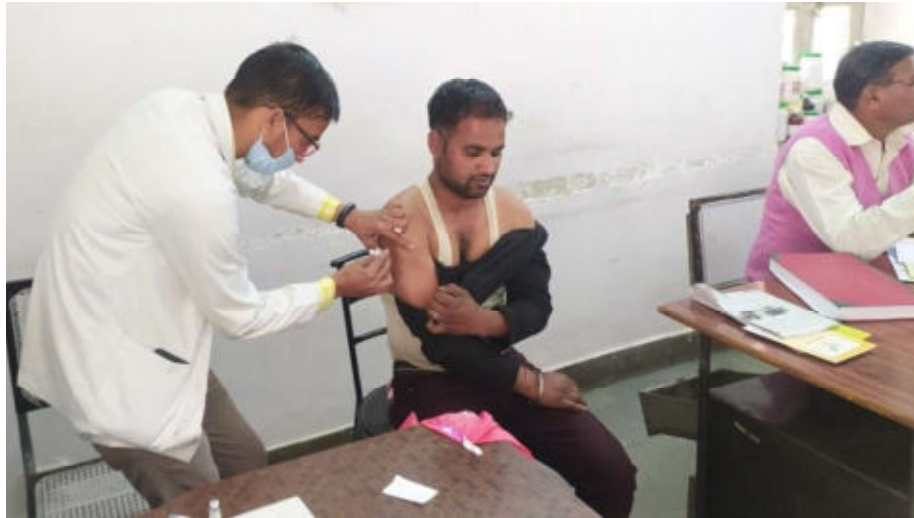
A Doctor administering covishield vaccination at GBS Office, Amer