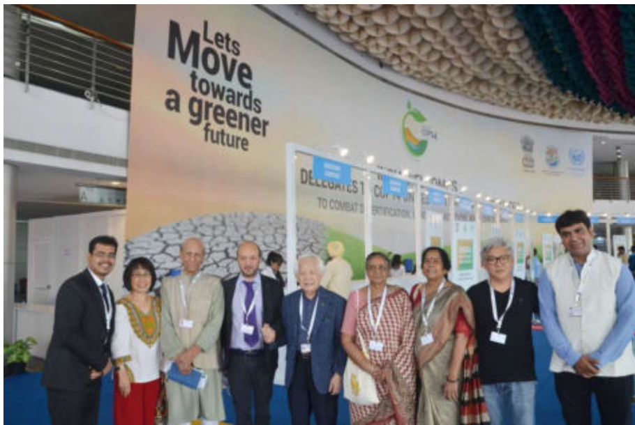
COP14 Participation held at New Delhi in 2020