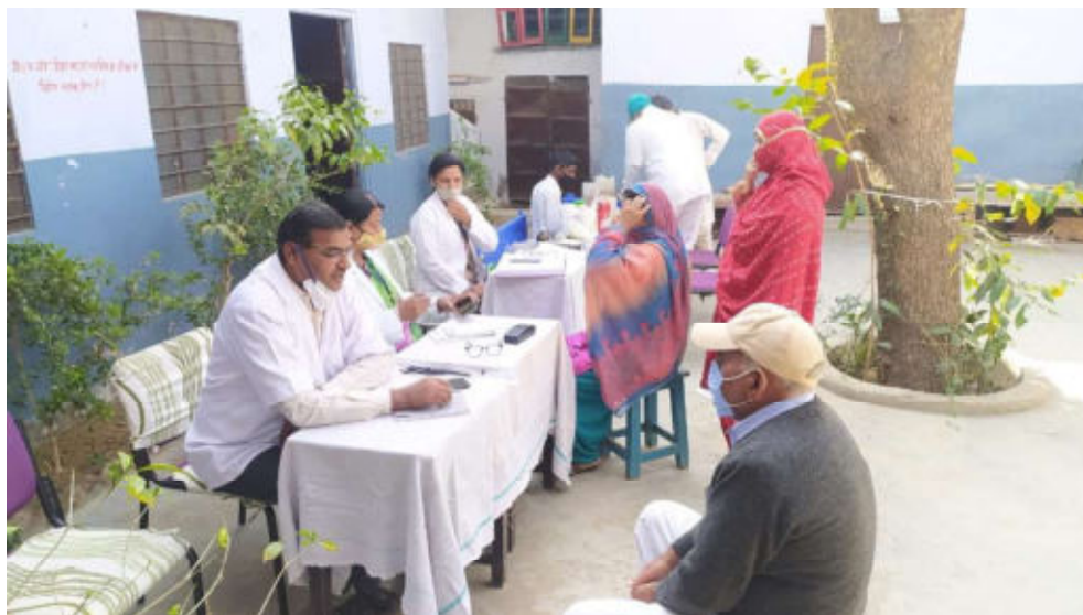
Picture depicting Ayurvedic camp organized with the support of GBS