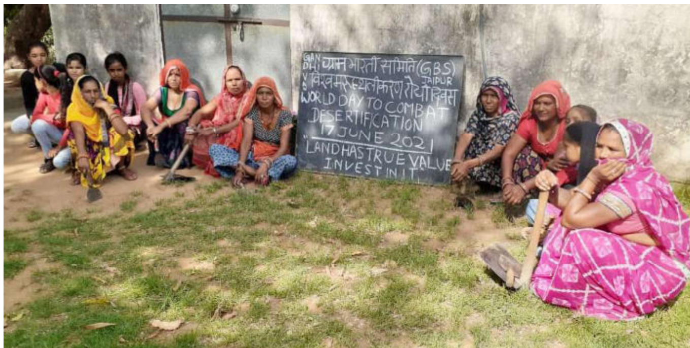
Display of Desertification day program by Gram Bharati Samiti

Major portion of land in Rajasthan is dry due to lack of water resources. As a result major portion of the land is neither cultivated nor utilized for any agri and allied production purpose. In this regard, Gram Bharati Samiti took initiatives and developed green forestry in a span of thirty years substituting sand pits.