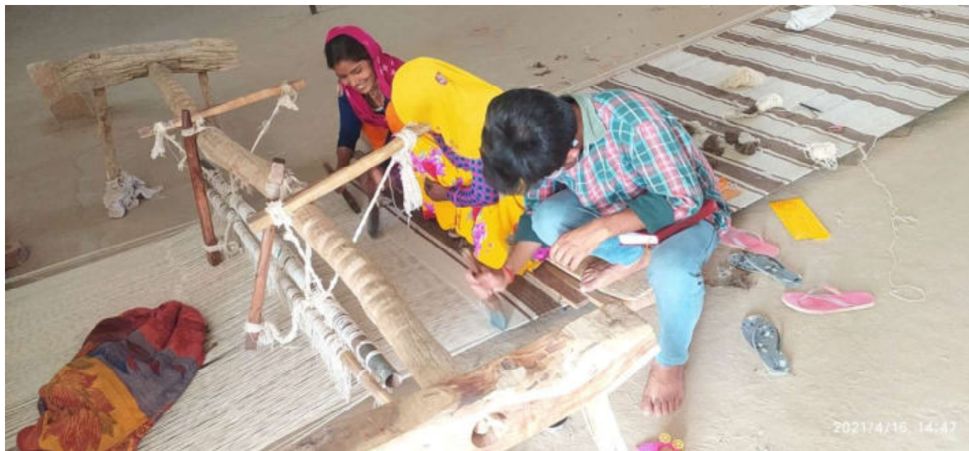
A women artisan preparing cotton mat (Handicraft) at Jaipur Rajasthan India

Due to the support of NOREC project women got orders of masks, bags and cotton mats from local markets, MNCs, Govt. departments across India. Gram Bharati Samiti shared few samples were shared to Khadi organization in UK for their approval.