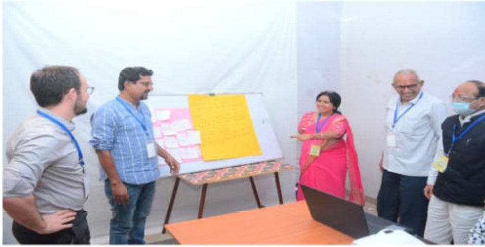
Group presentation on the challenges and solutions for sustainable agro ecology in India