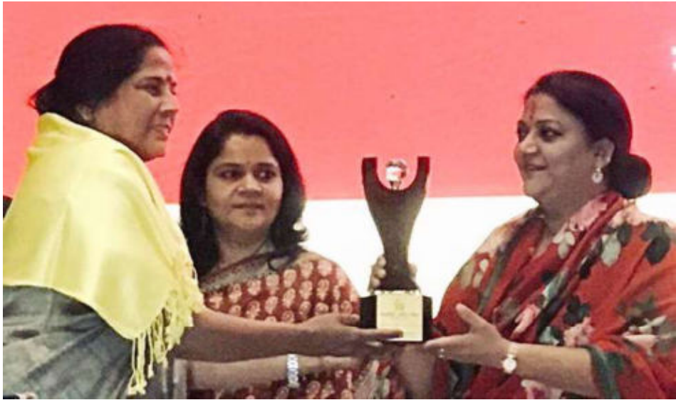
Mahila Shakti Puraskar 2019 by Government of Rajasthan