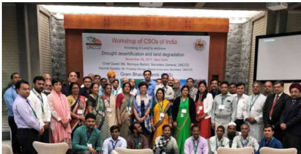
Workshop of CSOs of India in New Delhi