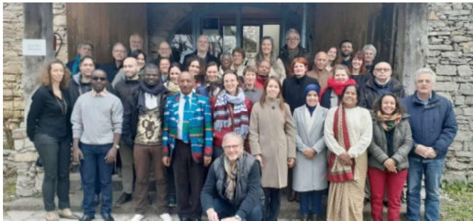
AVACLIM design phase meeting in France(2020)